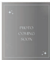
FANNI GREEN (MICKI)