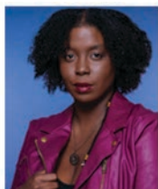
IVY SUNFLOWER (LORI/YOUNG WOMAN 4)